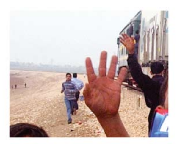
Casio, Seiko, Sheraton, Toyota, Mars, 2004–2005