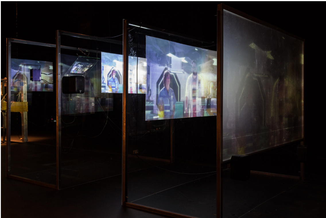
Installation view of Neil Beloufa: Counting on People 24 Sep 2014 – 16 Nov 2014 Institute of Contemporary Arts London (ICA)