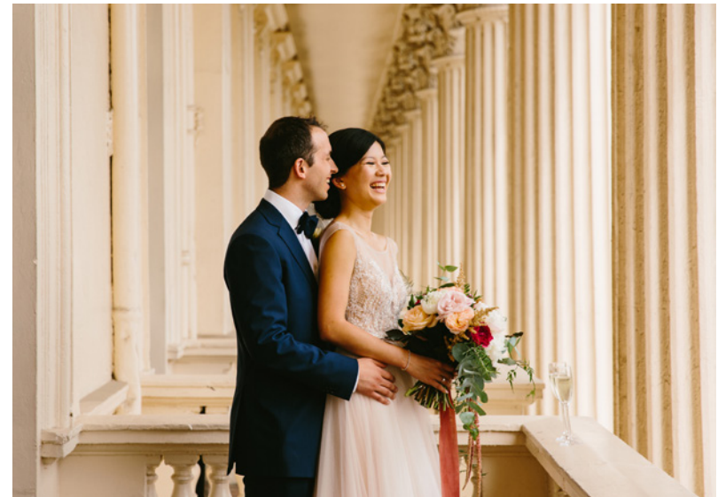
Photography @ The Twins