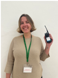
Operations and Visitor Services